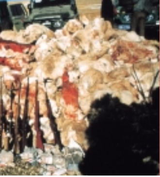
Poachers caught by IFAW funded anti-poaching patrol and confiscated chiru pelts, horns and poachers guns