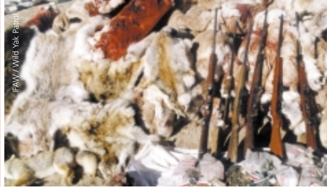
IFAW / Wild Yak Patrol