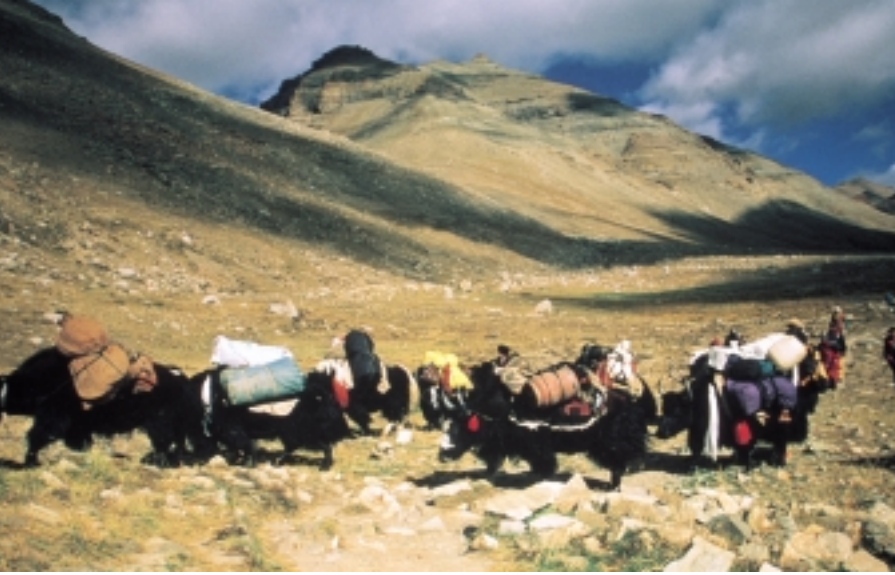
A yak caravan near Darchen, Tibet. A large amount of shahtoosh is carried by such caravans.