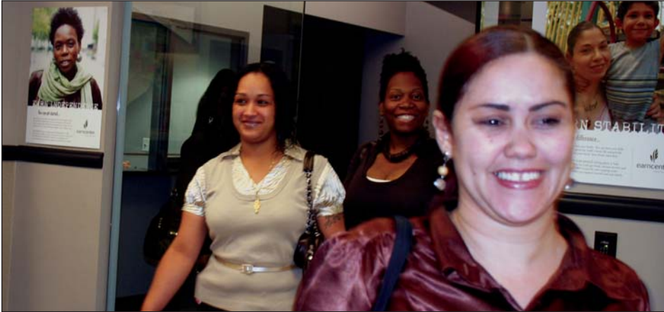
Esperanza EARN Center welcomes new clients.

In its quest to continue the expansion of existing services to the North Philadelphia community, Esperanza has successfully launched what it hopes to develop into the centerpiece of its workforce development division: its EARN Center. EARN, which is the acronym for "Employment Advancement Retention Network", appropriately states the ultimate goal of its efforts; helping families to become self-sufficient by assisting them to acquire and retain employment which earns for them a respectable living.