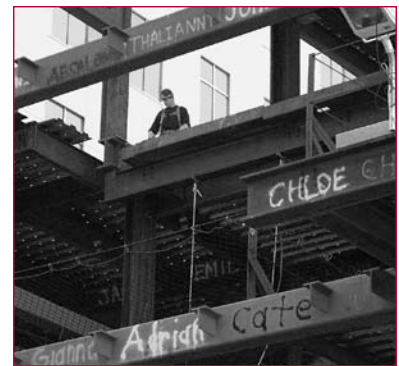
Jimmy Fund Clinic patients featured on ABC’s “World News Tonight with Charles Gibson”