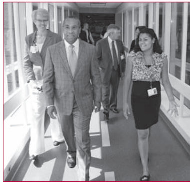
Massachusetts Governor Deval Patrick visited Dana-Farber to observe the Summer Jobs Program, through which Boston-area high school students get to work in DFCI labs and administrative posts, and learn about healthcare