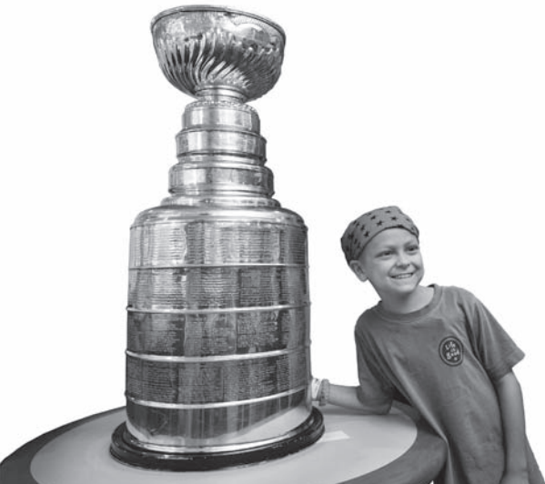
A Jimmy Fund Clinic patient got up close and personal with the Stanley Cup trophy after the Boston Bruins won the championship in June